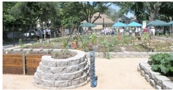
Fremont Community Garden

The City of Sacramento recently introduced an ordinance to allow for community gardens on private lands. The ordinance was presented by the city's planning department and discussed at four community meetings around the city. There was strong support for developing an ordinance along with significant concern from community members about some of the provisions in the ordinance, including the cost of developing a garden. The ordinance is scheduled to go before the City Council in June, tentatively at the June 21st Council meeting. If you're unable to attend the meeting but would like to submit comments regarding the ordinance, you can do so